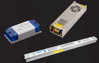
LED power supplies