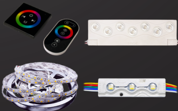
LED lighting and accessories