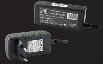
Desktop & Adapter power supply