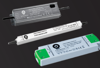
Furniture LED drivers