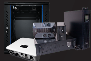
Emergency power systems